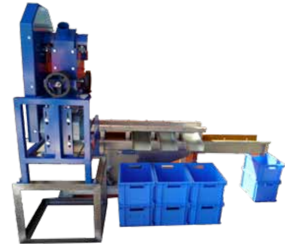
LMC 100-D with screening section